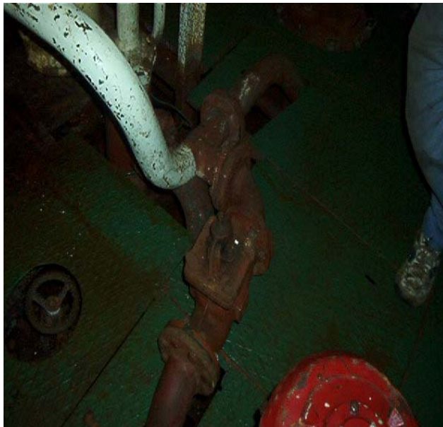
Fire valve handle missing