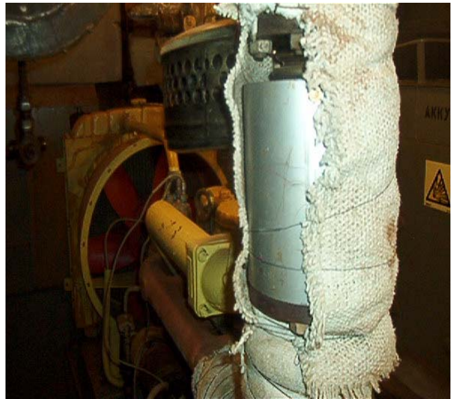
Insulation screen missing