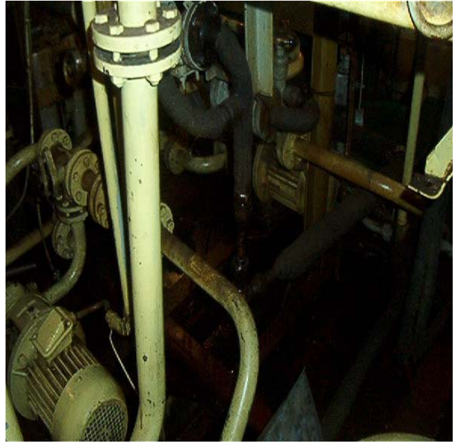
Fuel oil leak – screen missing