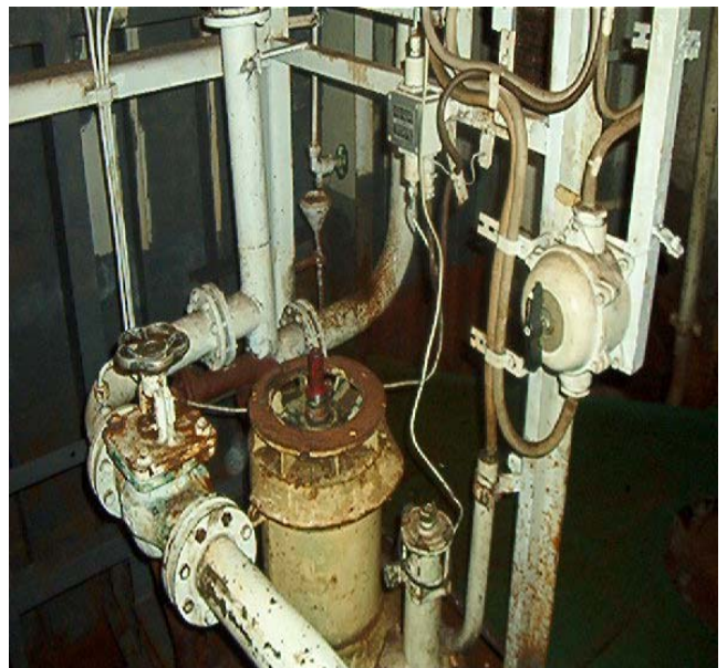
Pump safety guard missing