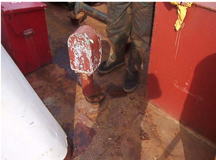
Screw bolts and safety boots missing

The ship was surveyed by two inspectors of the Russian Maritime Register of Shipping until departure. Detention was conditionally raised for other corroded main engine sea water cooling pipes.