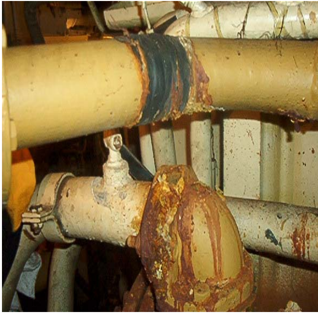
Cooling water pipe corroded