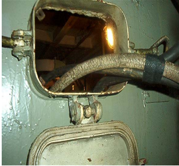
Water hose and electric wires through fire flap