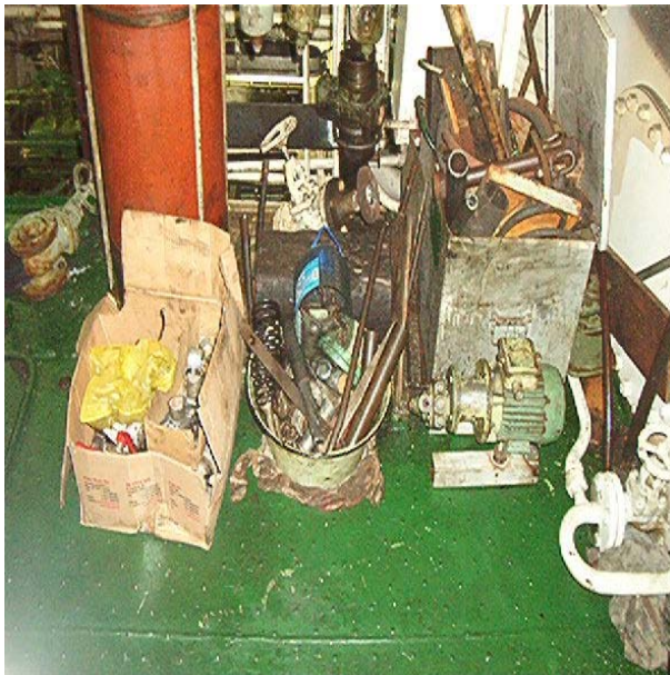
A lot of scraps lashing missing

The PSCO noticed that engine room bilges and pump room bilges were full. The oily mixture was flowing to the floor plates. The PSCO found a lot of goods in the engine room without necessary lashing. Some of the engine cooling water pipes were in poor condition.