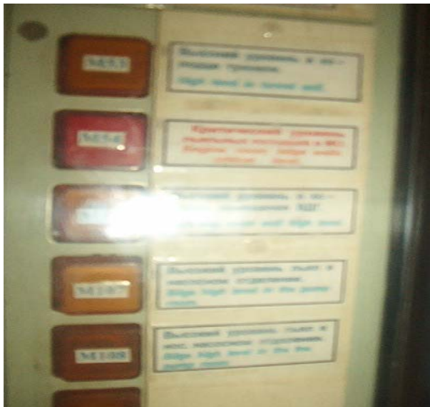
Engine and pump room, bilge

The Class and statutory certificates issued by Germanischer Lloyd (ISM by Russian Maritime Register of Shipping) were found valid. The Oil Record book (last entries 31.01.2006) recorded only 0.58m 3 sludge on board. Entries about bilge water were missing. The Port State Control Officer (PSCO) found the bilges/tanks alarm panel red during investigation of the bridge. Bilge tanks, engine room bilges, pump room bilges, high level alarms were activated.