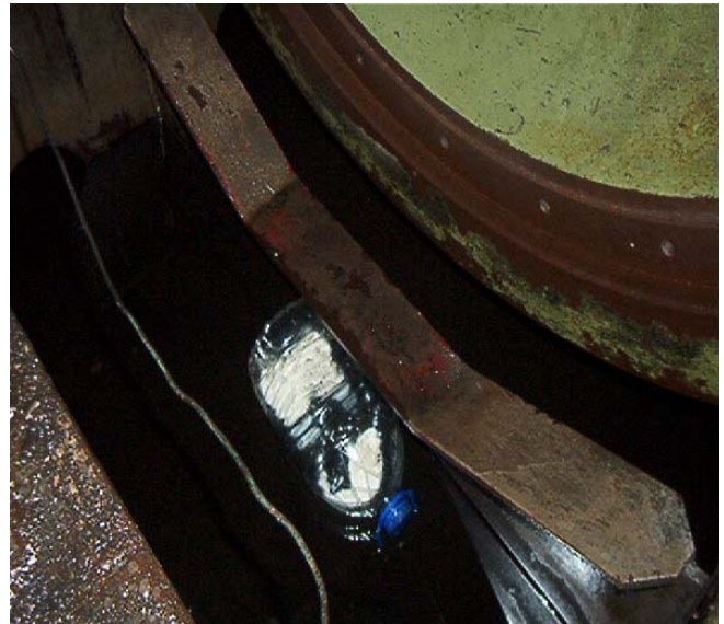
Engine room bilges disposed ashore sludge tanks full